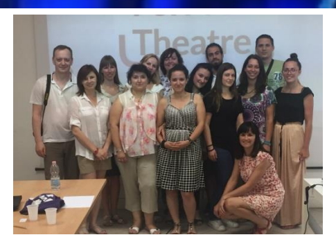
Representatives of partner countries during their second meeting 13-14th July, 2016 Venice, Italy.